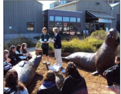
Long Marine Lab Discovery Center

Many of the girls found the best things about the activities were looking through the mud and knowing that "all these creatures exist", while for others it was looking at the dolphins and getting hands-on experience at the touch-pool.