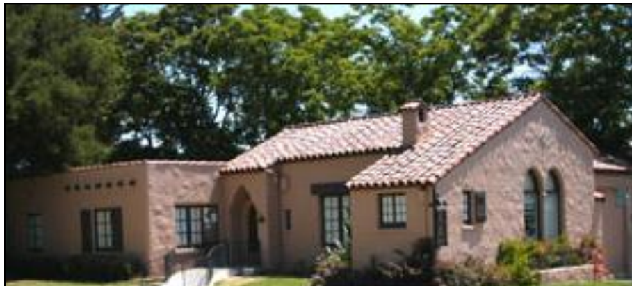
Art Museum of Los Gatos