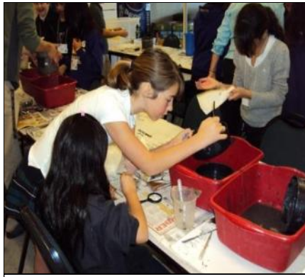
Environmental Center in Alviso

The on-campus class found several invertebrates in the ooze while learning about the importance of the San Francisco Bay ecosystem and its relationship to the deep ocean. The field trip took the girls to Santa Cruz for a look, and feel, of the ocean environment at